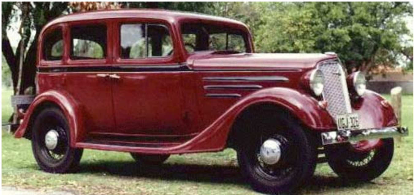
1935 Chevrolet Standard

The cars on this and the following page are 1935 Chevy Sedans. The one below is the type owned by Howard, a 4-door Standard. The one on the following page is a 4-door Master. The differences between the Standard and Master are interesting. All four of the Master's doors are "Suicide Doors"—doors